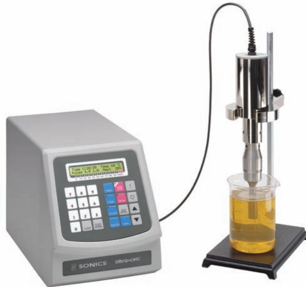
VC 505 – VC 750